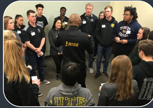
Leadership Workshops & Roundtables