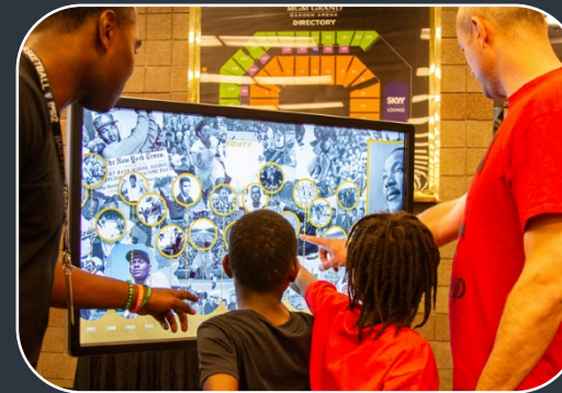
"Champions of Change" Fan Activation