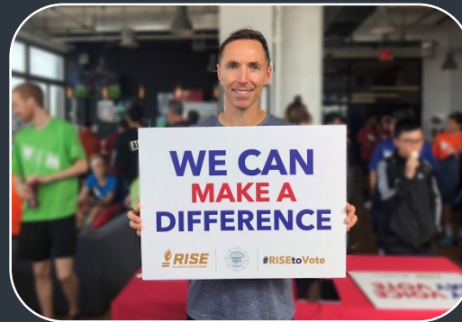
Civic Engagement (includes RISE to Vote)