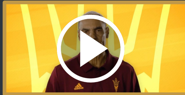
RISE PSA PLEDGE VIDEO: PAC 12 FOOTBALL