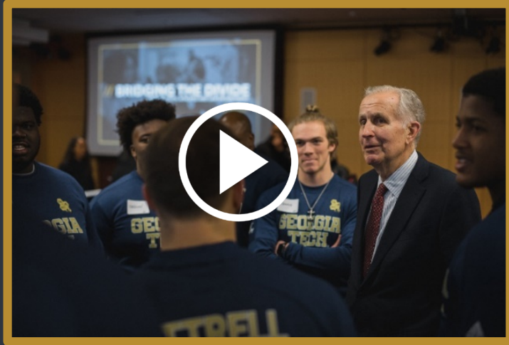
RISE Super Bowl LIII: Bridging the Divide Program with Georgia Tech Football