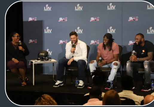
Critical Conversations or Town Halls